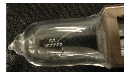
Cold fracture of a filament coil.

Coils may break whilst hot or cold. If a coil is neither conducting nor adjacent to a heat source, it will be brittle, and may fail by brittle fast failure in the event of a collision. This is typified by bright, evenly spaced coils and if often termed "cold shock". Ductile filaments will sometimes demonstrate necking and will not show the same uniformity as the example below.