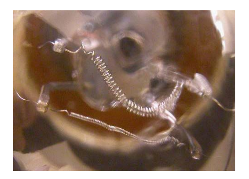
Dual filament brake/tail lamp. The finer tail filament was not incandescent, but was heated by the lit brake coil.

incandescent and heats the other. The filament that deforms the greatest will usually be the coil that was illuminated; however other factors such as the wire gauge must be taken into account, and so this is only a guide.