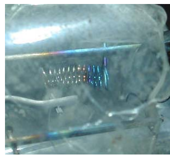
Filament heated by neighbouring coil. Note the tinting.

If the bulb is broken, the filament will contact air as the inert gas escapes, and if the coil is hot, the tungsten will oxidise. If the coil is hot yet not incandescent, the tungsten may appear tinted with colours ranging from straw to greens and purples, however if the lamp was lit, the oxides are mostly black, in addition 'oxide smoke' may form which is deposited on adjacent sufaces. An extreme example of this is shown in the image below.